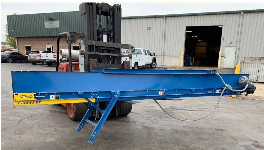
Optional Conveyor 21-147